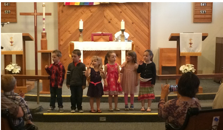
Preschool Sunday, 2016