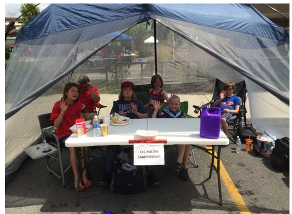
At Car Show, the young people working a booth