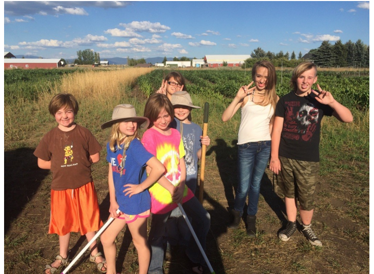
GIVING GARDEN GIRLS!

9:00 a.m. Worship Service w/ Children's Church 10:00 a.m. Fellowship 10:30 a.m Adult Education 10:30 a.m.. Connect Tweens Time